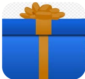
Gifts for Rectory