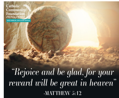
Easter Sunday of the Resurrection of the Lord

We are a people of hope because of today, the day God conquered death. There is no thought more preposterous or delightful than God becoming man, dying, and conquering death for us because we are given hope through his blood. The only enemy left to fear now is sin. "The last enemy to be destroyed is death," said Paul in 1 Corinthians 15:26. Any person called "Christian" can shout: "Where, O death, is your sting?" (1 Corinthians 15:56).