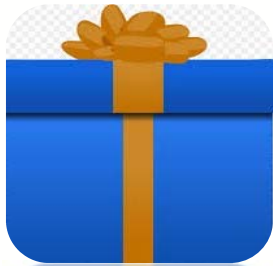
Gifts for Rectory